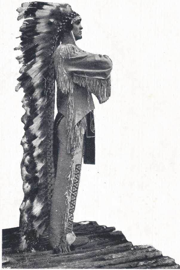
ERIEZ LODGE Camp Sequoyah, Erie, Pa.